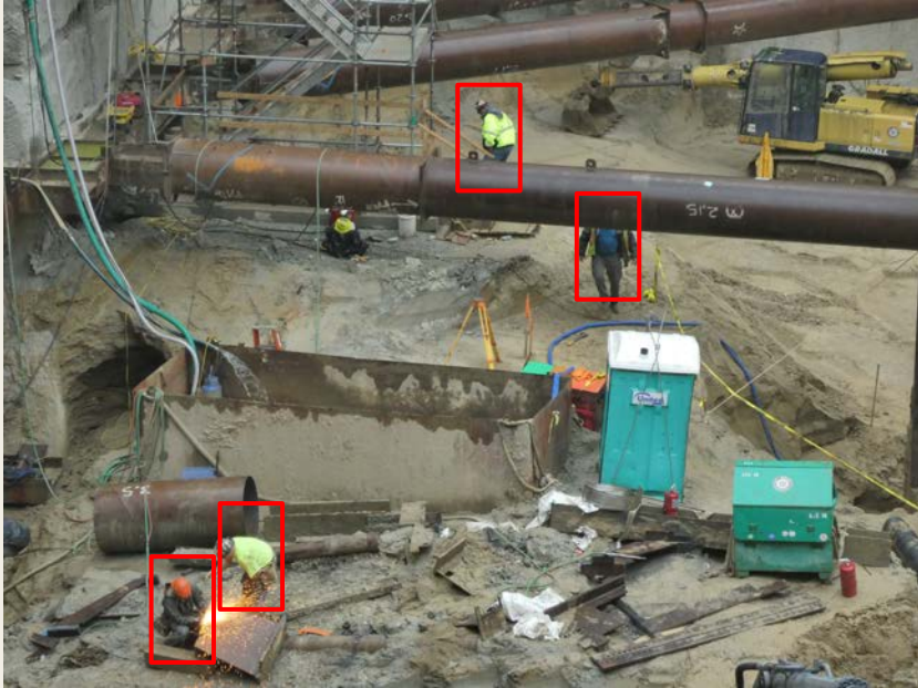
Smartvid.io “sees” every worker...