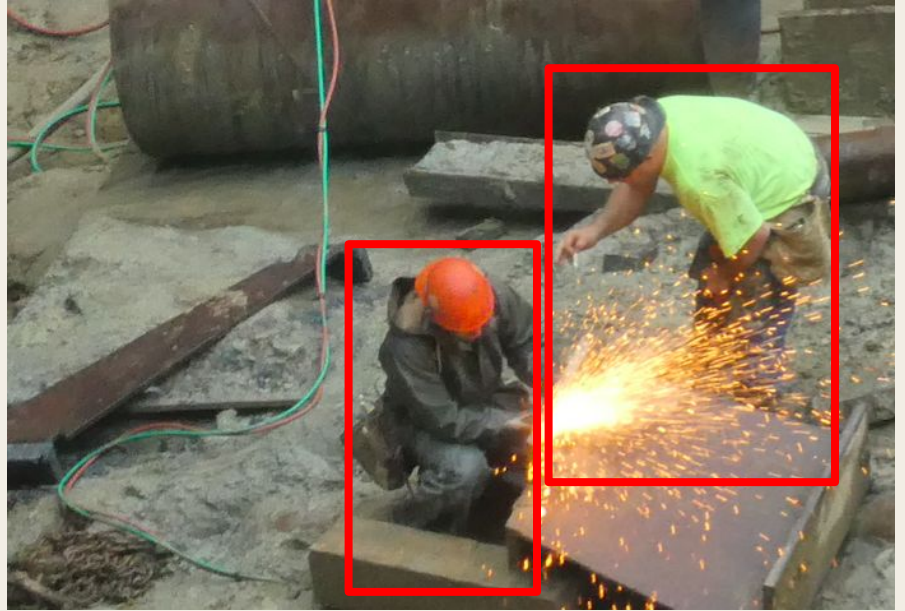
...and makes observations about missing PPE