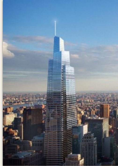
One Vanderbilt, New York AECOM